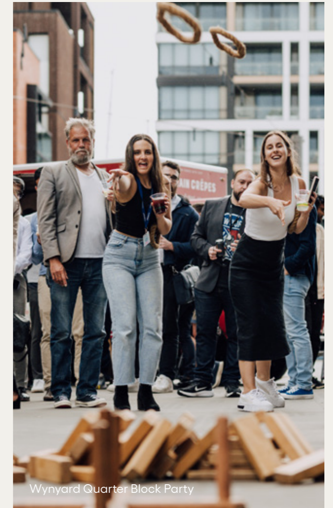
Wynyard Quarter Block Party