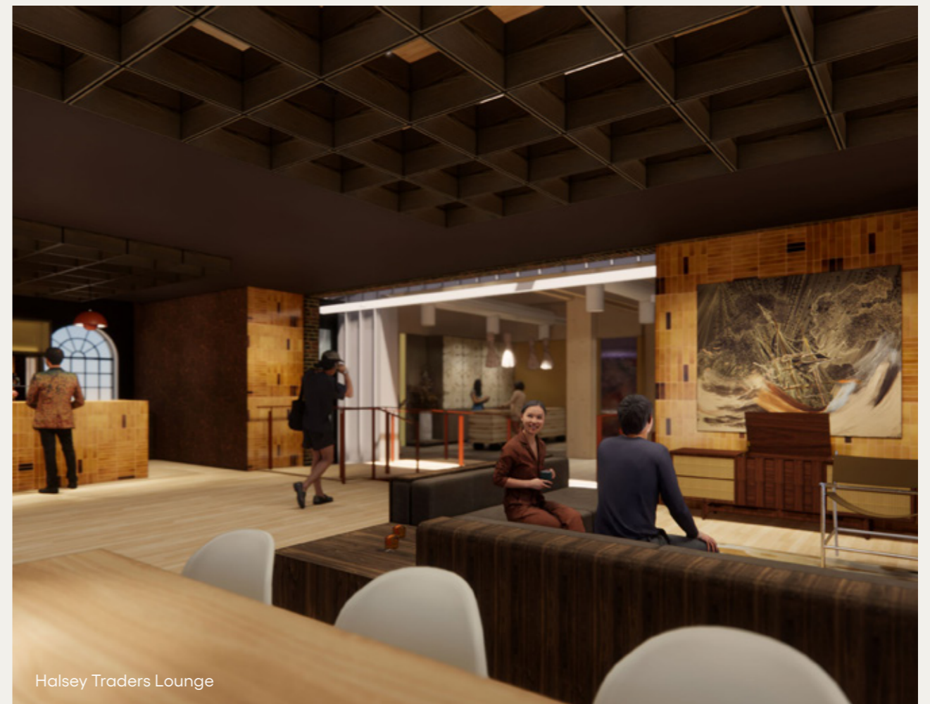
Halsey Traders Lounge