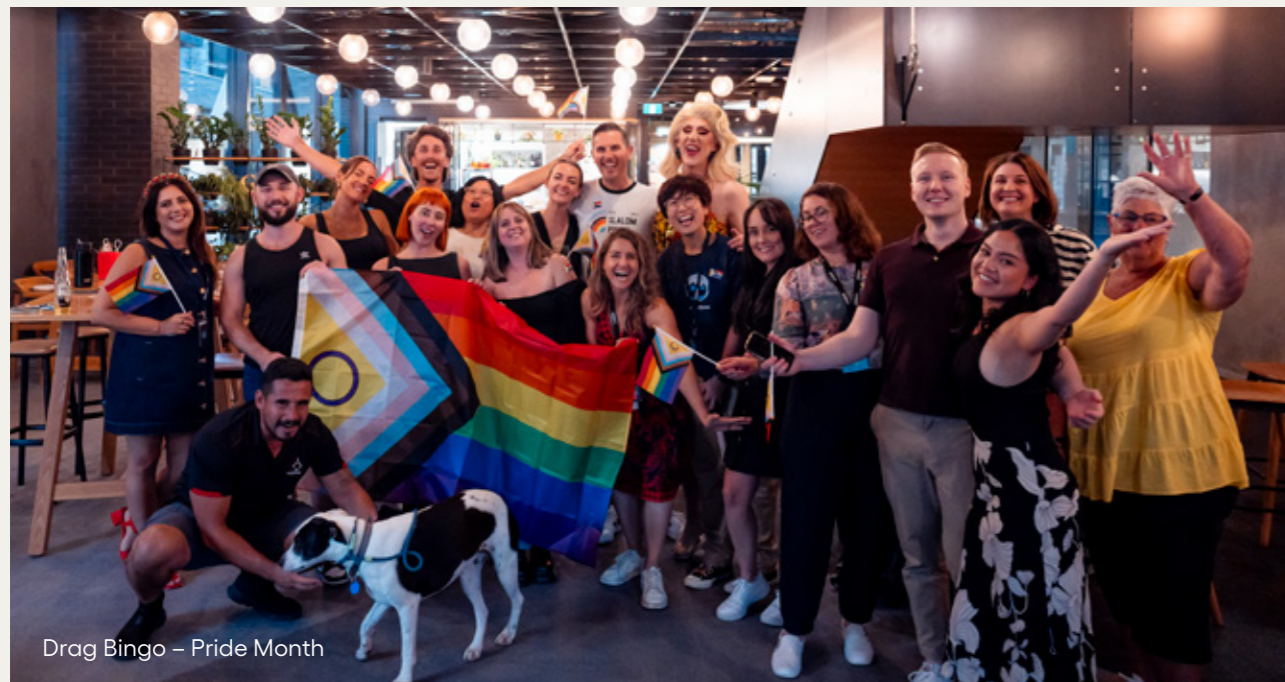
Drag Bingo - Pride Month